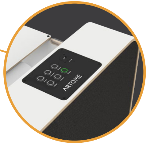
1x USB-A (5V=1A) (Webcam Connection)