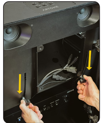
3. Lock the angle adjustment to the Bottom position