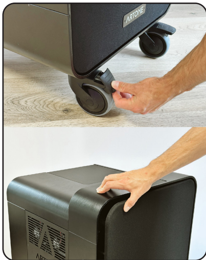
1. Lock the wheels and open the front door