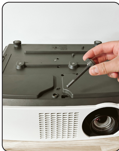
5. Remove the projector's front leg (Skip this if VMZ7ST or VMZ6ST)