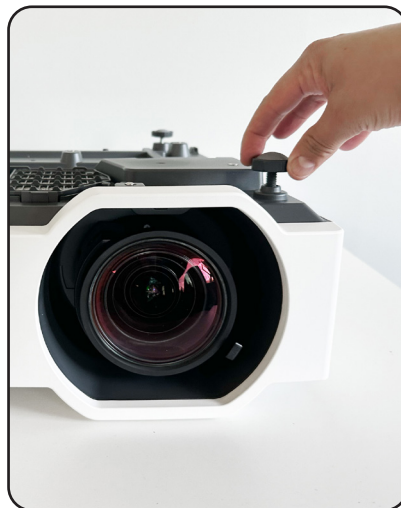
5. Extend the projector's legs well out before installation.