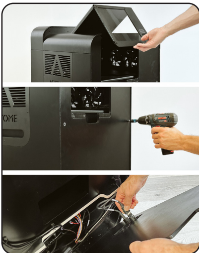
4. Open the lens hatch. Remove the back cover (HEX3) and disconnect the pass-through cables