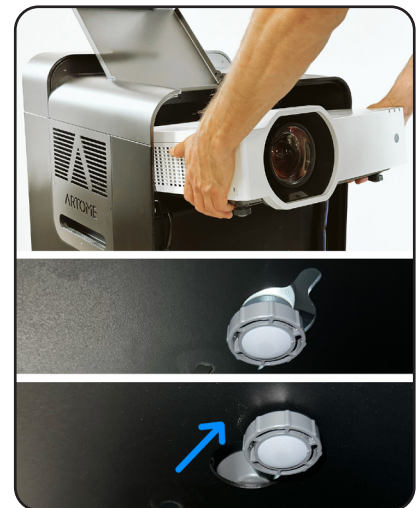
6. Carefully slide in the projector, align the back legs with the alignment holes, and tighten the legs.